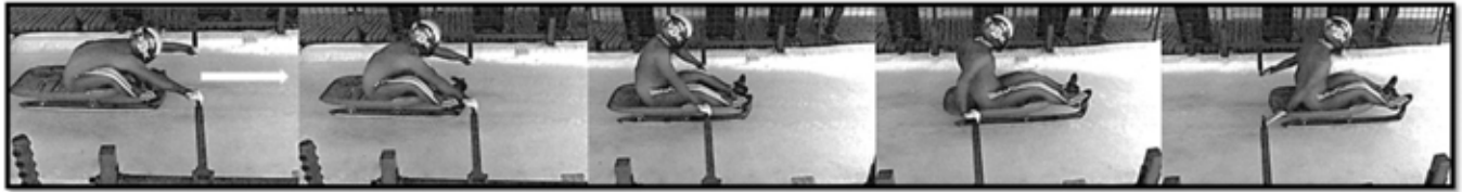
The first three images show an athlete pulling up to the start handles. Push-off is shown in the last two images